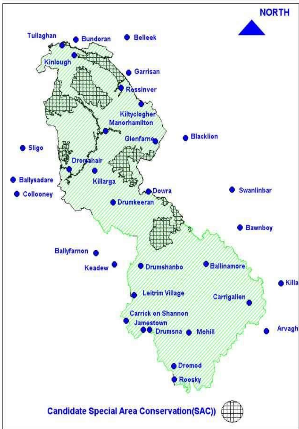
Figure 2 County Leitrim Candidate Special Areas of Conservation