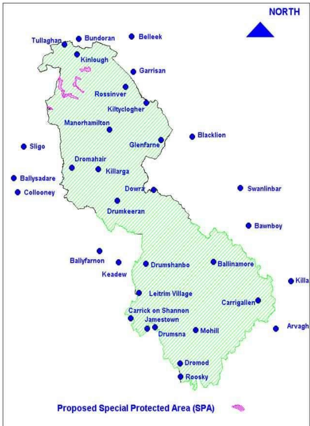
Figure 1 County Leitrim Proposed Special Protection Areas