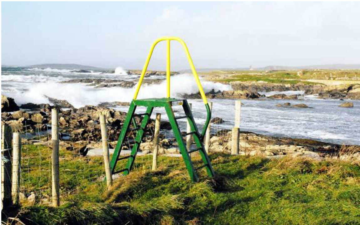
Fig 4: Photo of indicative proposed Stile type

The currently abandoned walking trail (denoted as section A to B and D to E on Drawing No. 203/1590-2) extending from the local road L-8299 across the Yellow River and onto local road L-83002 will be made good. This section will be cleared of trees, vegetation and all hedges will be cut back. Fences, gates, crossings and drainage will be restored. At the original crossing point the clear span of the river is 30 to 40 m. It is deemed non feasible to construct a footbridge at this point. A new proposed crossing point to the East of the existing crossing was selected, the span is considerable less at this location. A new walking trail (denoted as sections B to C and C to D on Drawing No. 203/1590-2) will be provided. This will have to be agreed with landowners. The walking trails will be open, natural ground paths with stiles crossing at fences.