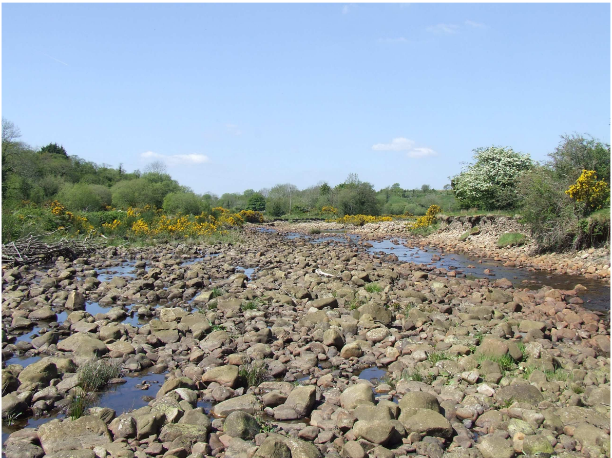
Fig 6: Photo of original crossing point on Yellow River (30 to 40m span)