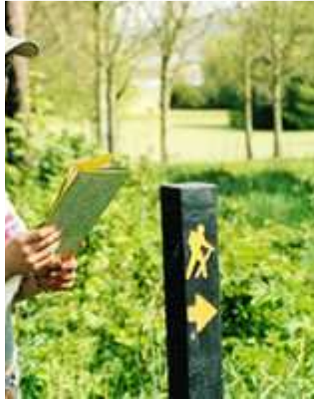
Fig 5: Photo of indicative proposed Waymaker Post type