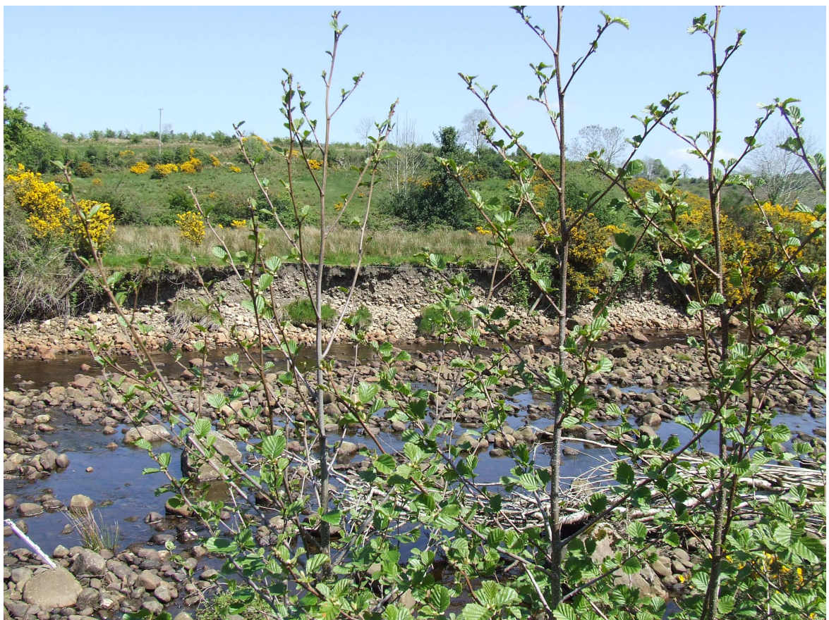
Photo 6: Southern Approach to Yellow River original crossing point