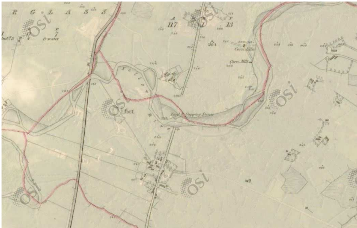
Fig 3: 6 inch raster map showing stepping stones across the yellow river

As can be seen in Fig 3, the original route of the Leitrim Way used stepping stones to cross the Yellow River