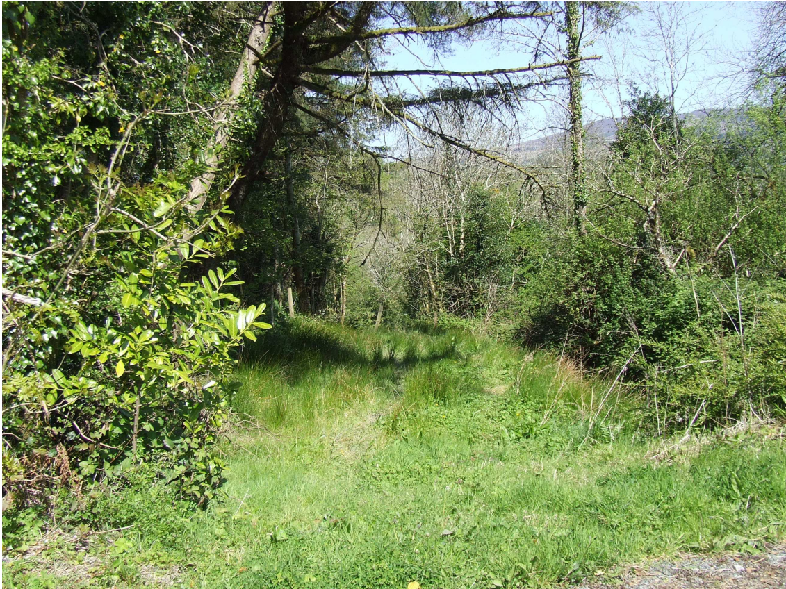
Photo 2: Southern Approach to Yellow River crossing point abutting L8299