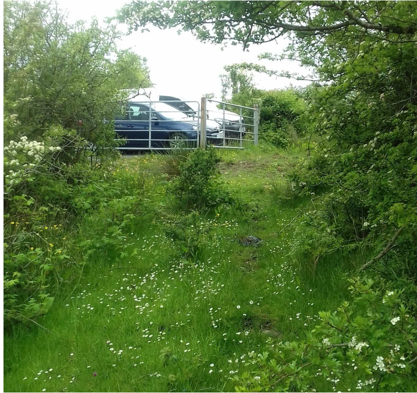
Photo 7: Northern Approach to Yellow River crossing point abutting L83002