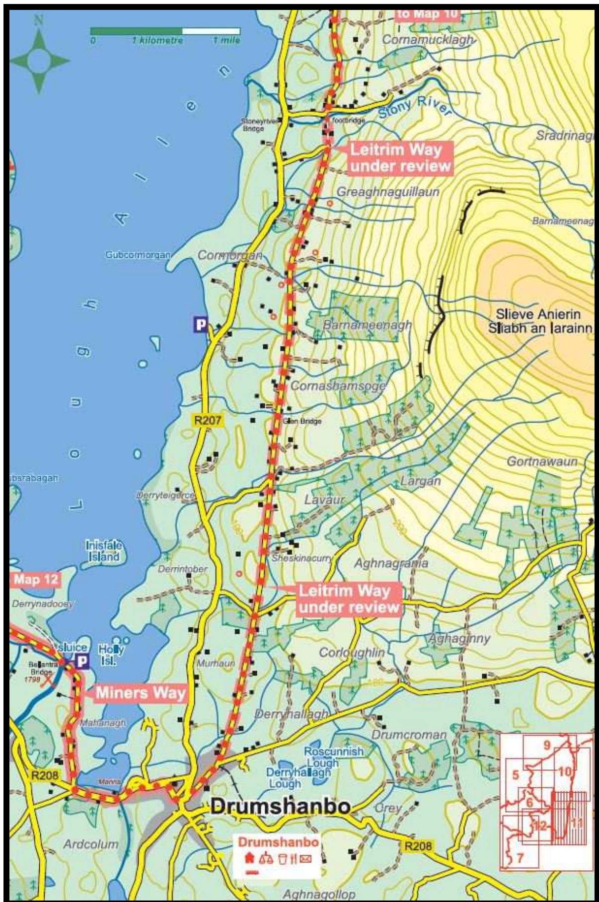
Fig 2: Map No 11 – Leitrim Way