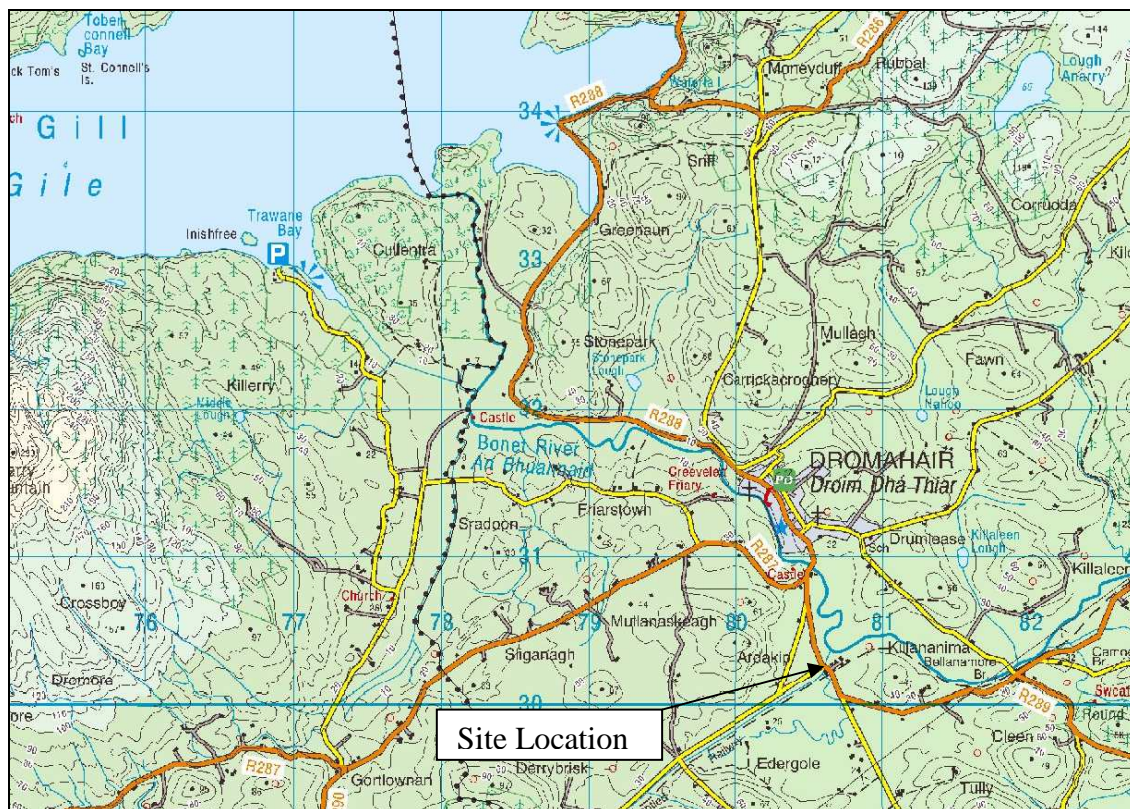
Fig 1: Site Location outside Dromahair

This application outlines proposals for the construction of new footbridge and footpath adjacent to the existing bridge over the Edergole River at the junction between the L4252 and the R287 at Ardakup and Killananima, Dromahair, County Leitrim. The proposal would safely accommodate pedestrian travelling from the village onto the Dromahair Abbey Loop and onto the SLNCR rail trail and vice versa.